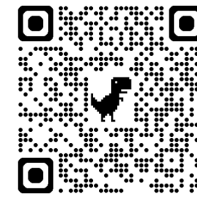
CAPRW Head Start