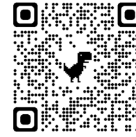
Pathway I scholarship