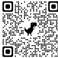
U of M Student Parent HELP Center Scholarships and Grants